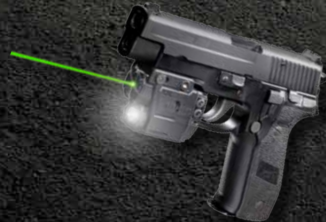
X5L UNIVERSAL MOUNT GREEN LASER W/ TACTICAL LIGHT