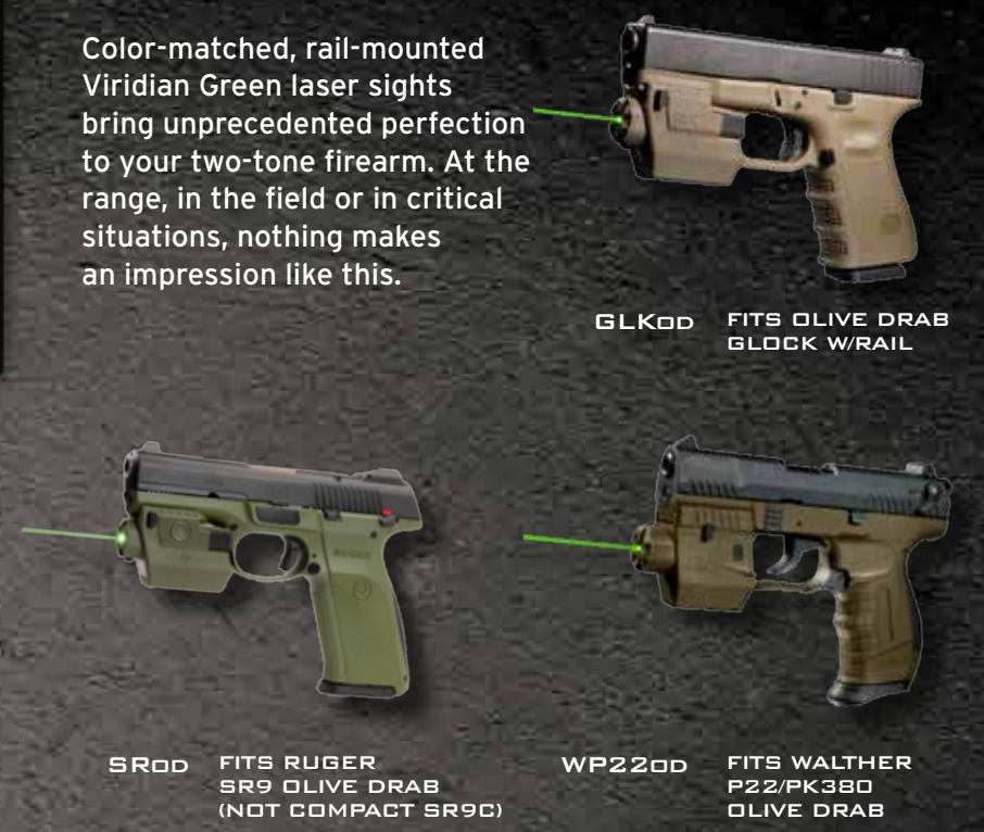
GLK0D FITS OLIVE DRAB GLOCK W/RAIL

Color-matched, rail-mounted Viridian Green laser sights bring unprecedented perfection to your two-tone firearm. At the range, in the field or in critical situations, nothing makes an impression like this.