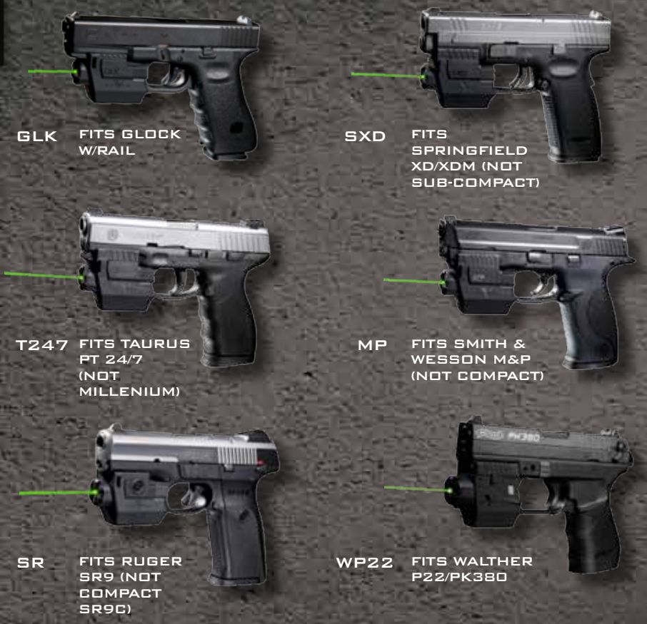
GLK FITS GLOCK W/RAIL

CUSTOM-FIT KYDEX HOLSTER INCLUDED WITH ALL GUN-SPECIFIC AND SPECIAL EDITION LASERS